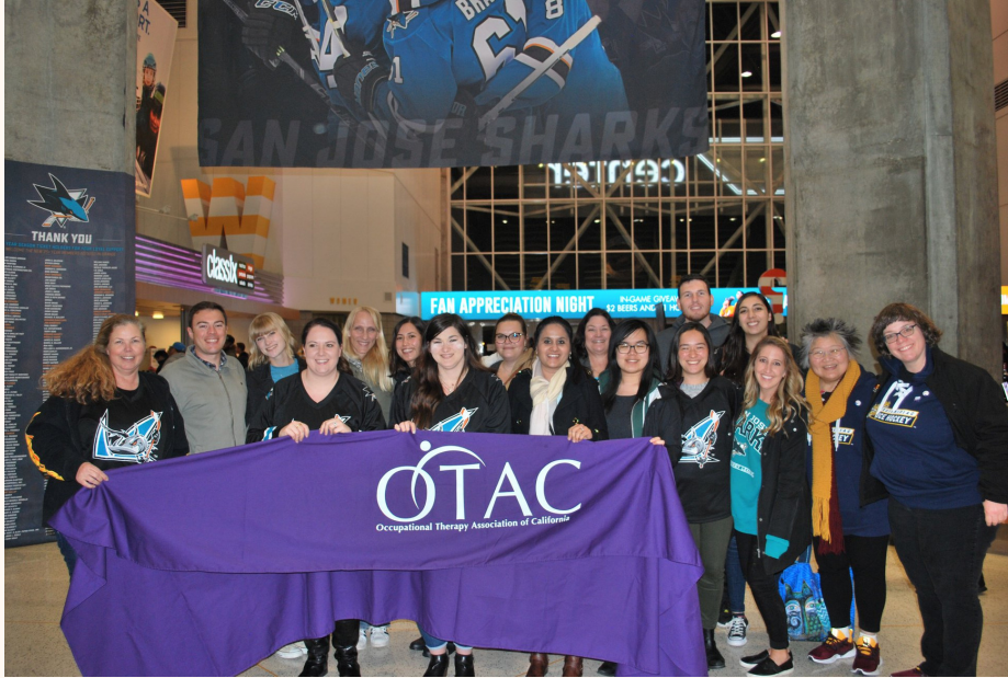
OTAC PAC at the Barracuda game