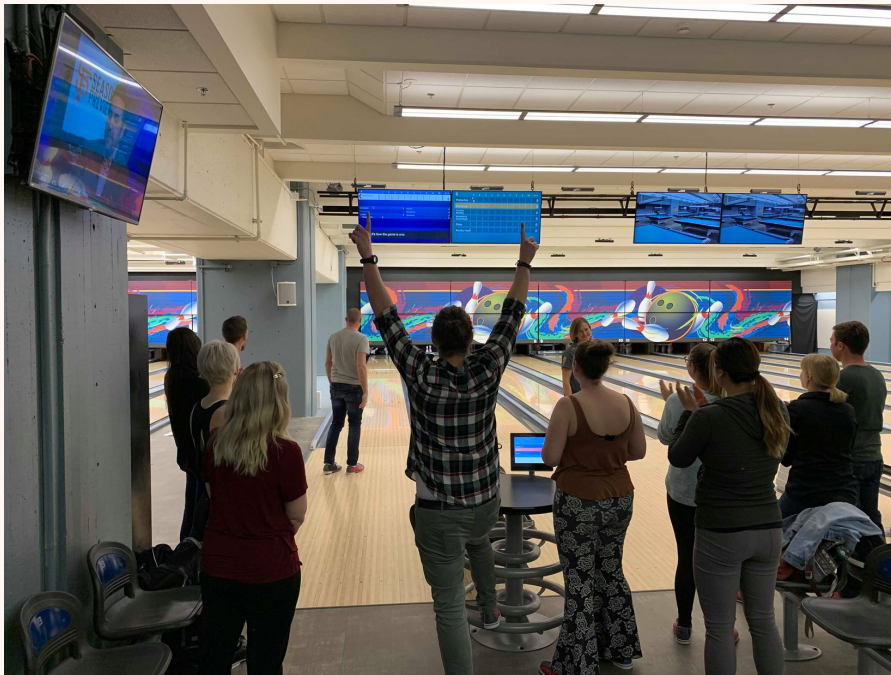
SOTA Bowling Social